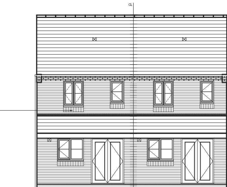
Plot 29 Plot 30 Rear Elevation