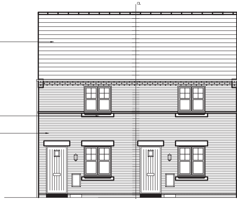
Plot 30 Plot 29 Front Elevation

Projecting brick verge detail with corbel